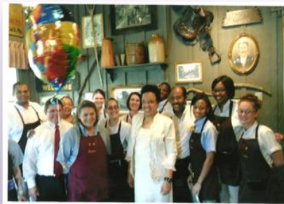
Submitted by The Cracker Barrel Team of Hampton, VA

So come love with me, laugh with me, cry with me, heal with me, stand with me, grow with me, build with me, and share with me. You are needed, you are wanted, and you are family.